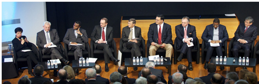
Fig. 2 Announcement of the London Declaration on NTDs in January 2012 by representatives of key partner groups in the global effort to combat NTDs, the World Health Organization, bilateral donor agencies (UKAID and USAID), ministries of health of endemic countries (Mozambique and Tanzania), pharmaceutical companies (GSK, Merck KGaA, and Esai), and philanthropic foundations (Bill and Melinda Gates Foundation). NTDs: Neglected tropical diseases

Expanded disease mapping, systematic data collection and monitoring of progress has allowed to know where the worlds neediest are, to track equitable access to preventive treatments, and to hold countries accountable [19, 20]. As an example, a recent collaborative initiative between Uniting to Combat NTDs , the WHO including ESPEN, and the Organization of African Unity (OAU), like the Africa Leaders' Malaria Alliance, has introduced a combined coverage score for the five most prevalent NTDs. This aggregate coverage figure that reflects a country's performance in implementing large scale preventive treatment is reviewed every year by African Heads of State at the OAU General Assembly. In the three years for which the NTD score has been calculated, 2015, 2016 and 2017, great progress has been achieved, with 15 OAU member countries having achieved the WHO recommended coverage of 75% or more for all five NTDs in 2017, as compared to only 3 in 2015. The number of countries having achieved between 25 and 74% coverage