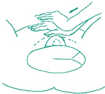
Figure 2 Suprapubic pressure (from SaFE study)