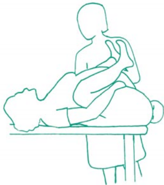
Figure 1. The McRoberts' manoeuvre (from the SaFE study)