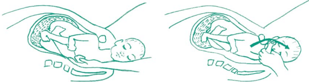
Figure 3 Delivery of the posterior arm (from the SaFE study)